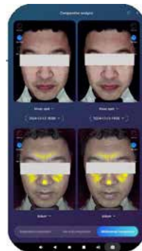
Comparison of 4 figures